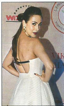
Malaika Arora Khan